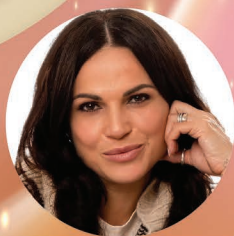
PRESENTERS Lana Parrilla